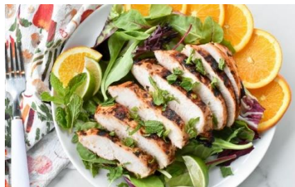
Mojo Marinated BBQ Turkey Breast

Energize with these summer recipes from Think Turkey, our 2024 National Protein Partner and Presenting Partner of the 2024 National Championships!