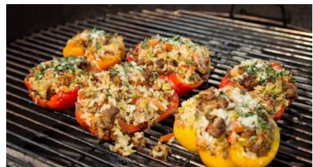
Mediterranean Turkey Sausage Stuffed Peppers