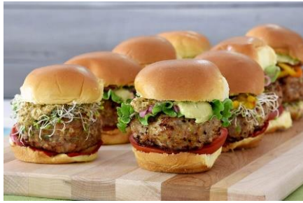
Green Goodness Turkey Sliders