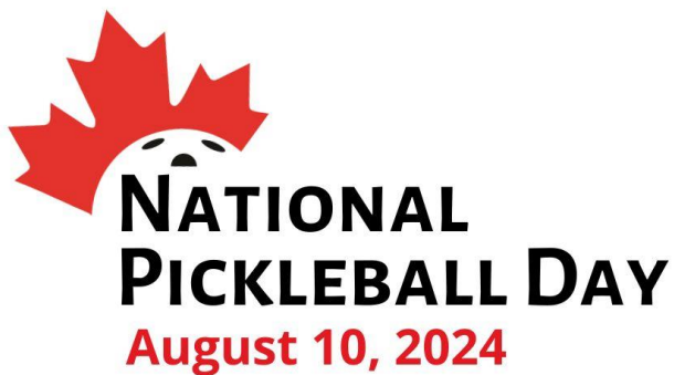
Logo - English