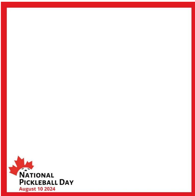
Social Media Frame - English