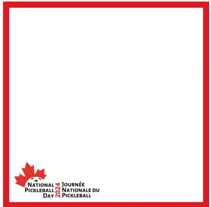
Social Media Frame - Bilingual