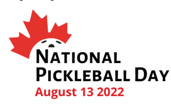
Logo - French