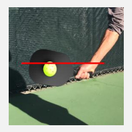
Figure 4-2 (illegal serve)