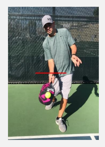
Figure 4-1 (legal serve)