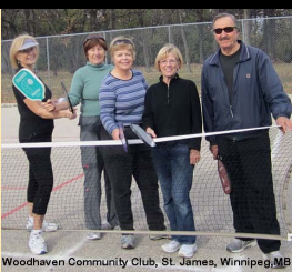
Woodhaven Community Club, St. James, Winnipeg, MB