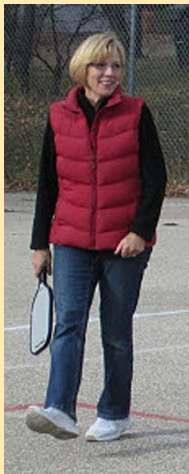
Oct. 25th How to dress for Pickleball in Winnipeg, late October.