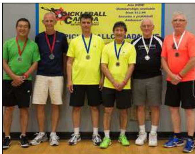
Mens Doubles 4.0