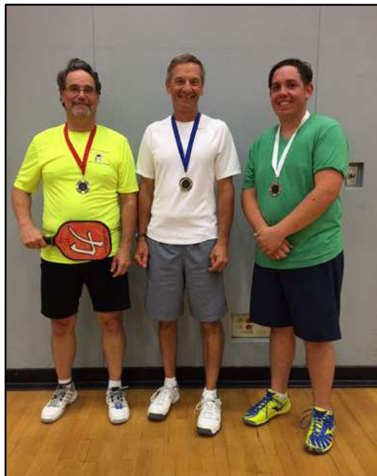
Mens Singles 3.0