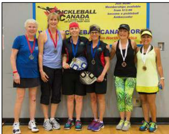
Ladies Doubles 3.0