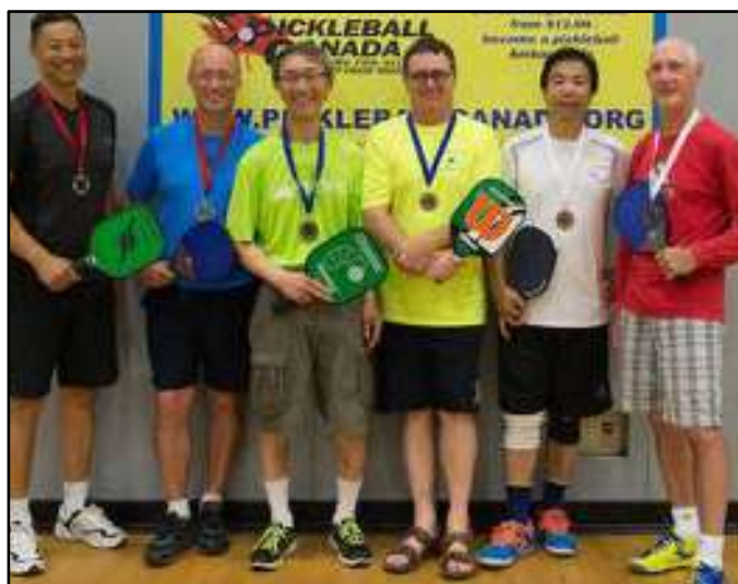
Mens Doubles 3.5