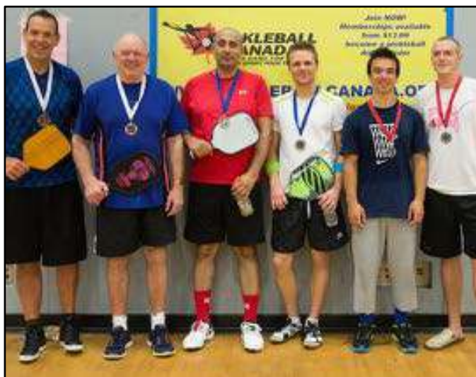
Mens Doubles Open