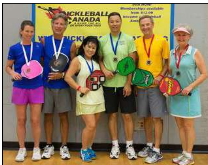
Mixed Doubles 3.5