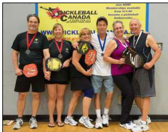
Mixed Doubles 3.0