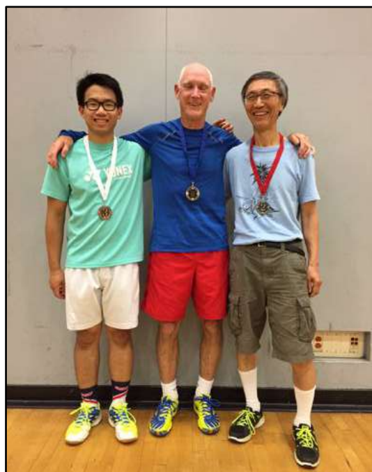
Mens Singles 3.5