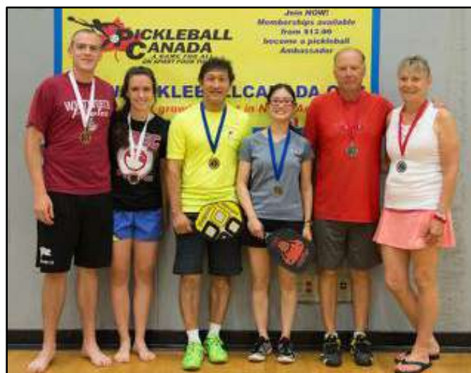
Mixed Doubles 4.0