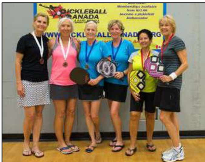
Ladies Doubles 4.0