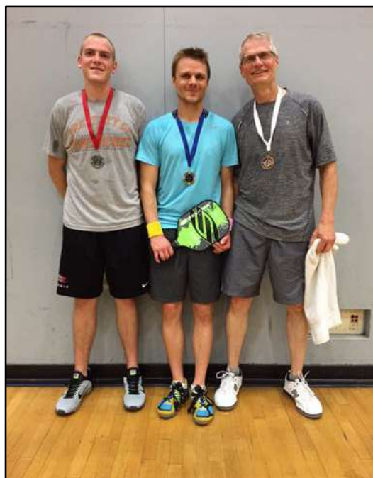
Mens Singles Open