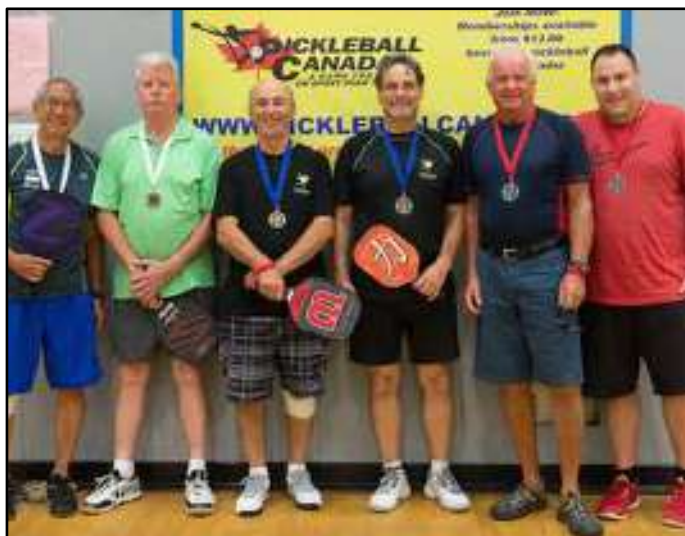
Mens Doubles 3.0