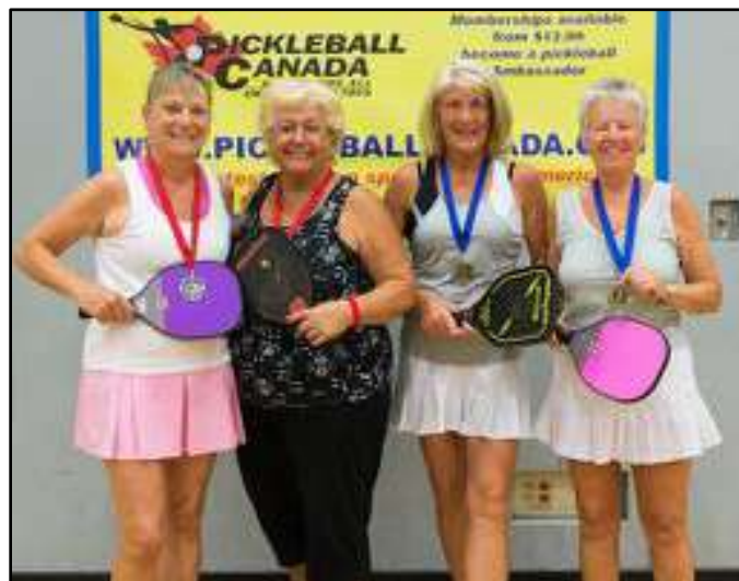
Ladies Doubles 4.5