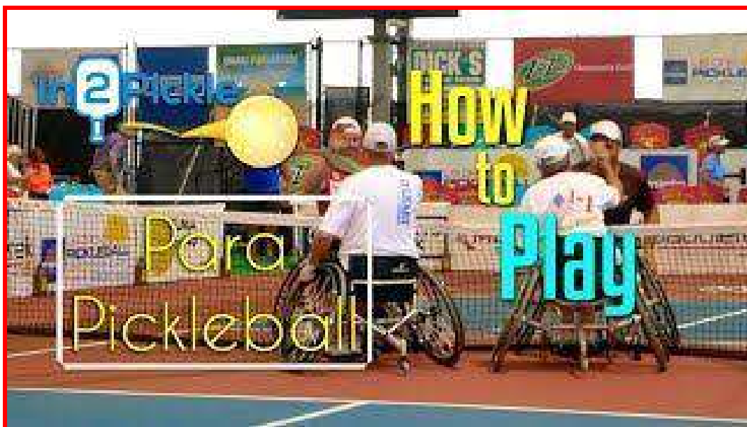
Para Pickleball - How to play